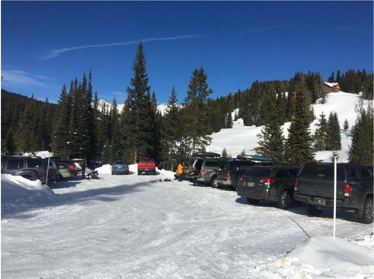
Existing USFS parking lot to remain unchanged